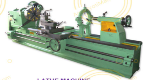
LATHE MACHINE HEAVY PLANNER TYPE CENTRE 28" / 30" / 32" / 34" / 38" / 46" 711MM / 762MM / 813MM / 864MM / 965MM / 1016MM