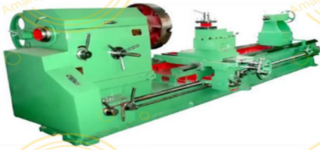
LATHE MACHINE ROLL TURNING PLANNER CENTRE 16" / 18" / 20" / 22" / 24" / 26" / 30" / 34" 406MM / 457MM / 508MM / 559MM / 610MM / 660MM / 762MM / 864MM